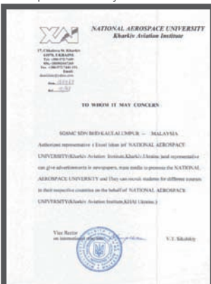
Authorization letter from Aerospace University