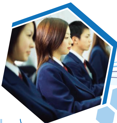
Speech by Pengarah IPT Ministry Of Higher Education Malaysia