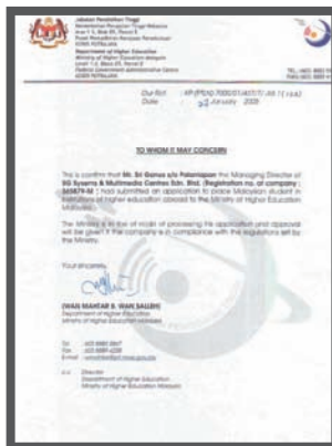
Authorization letter from Ministry of Higher Education Malaysia