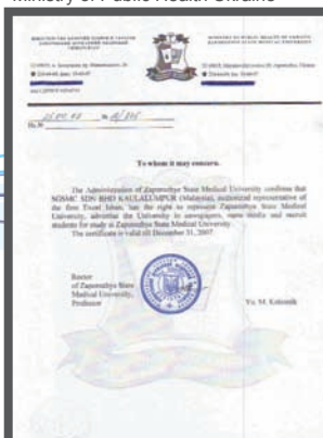
Authorization letter from Ministry of Public Health Ukraine