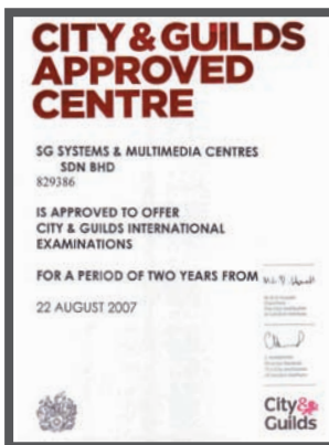
Authorization letter from City & Guilds International Examination