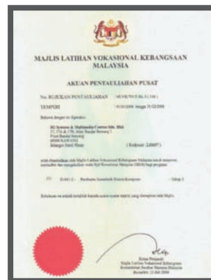
Authorization letter from Ministry of Human Resource Malaysia