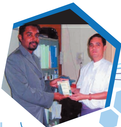
◀ Deputy Minister of Health Myanmar